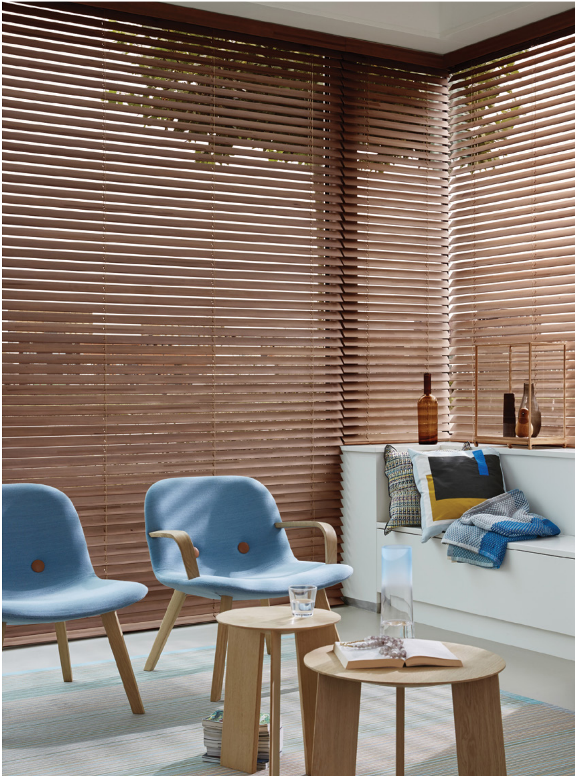
50mm Timber Venetians