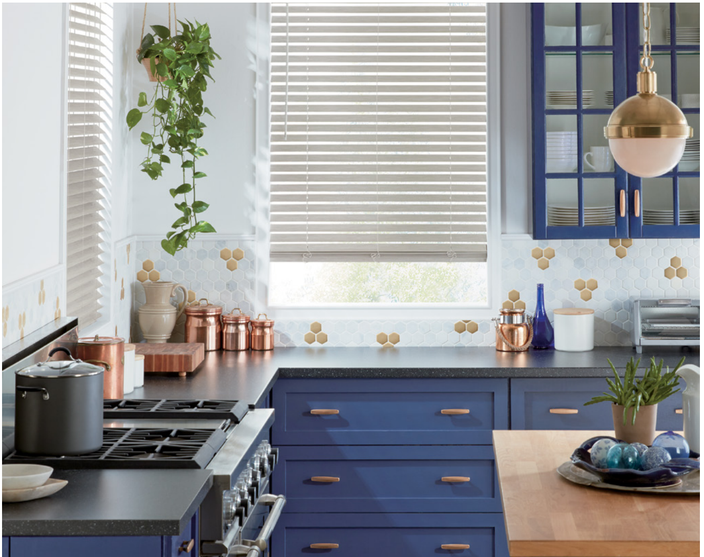
50mm Woodmates® Venetians