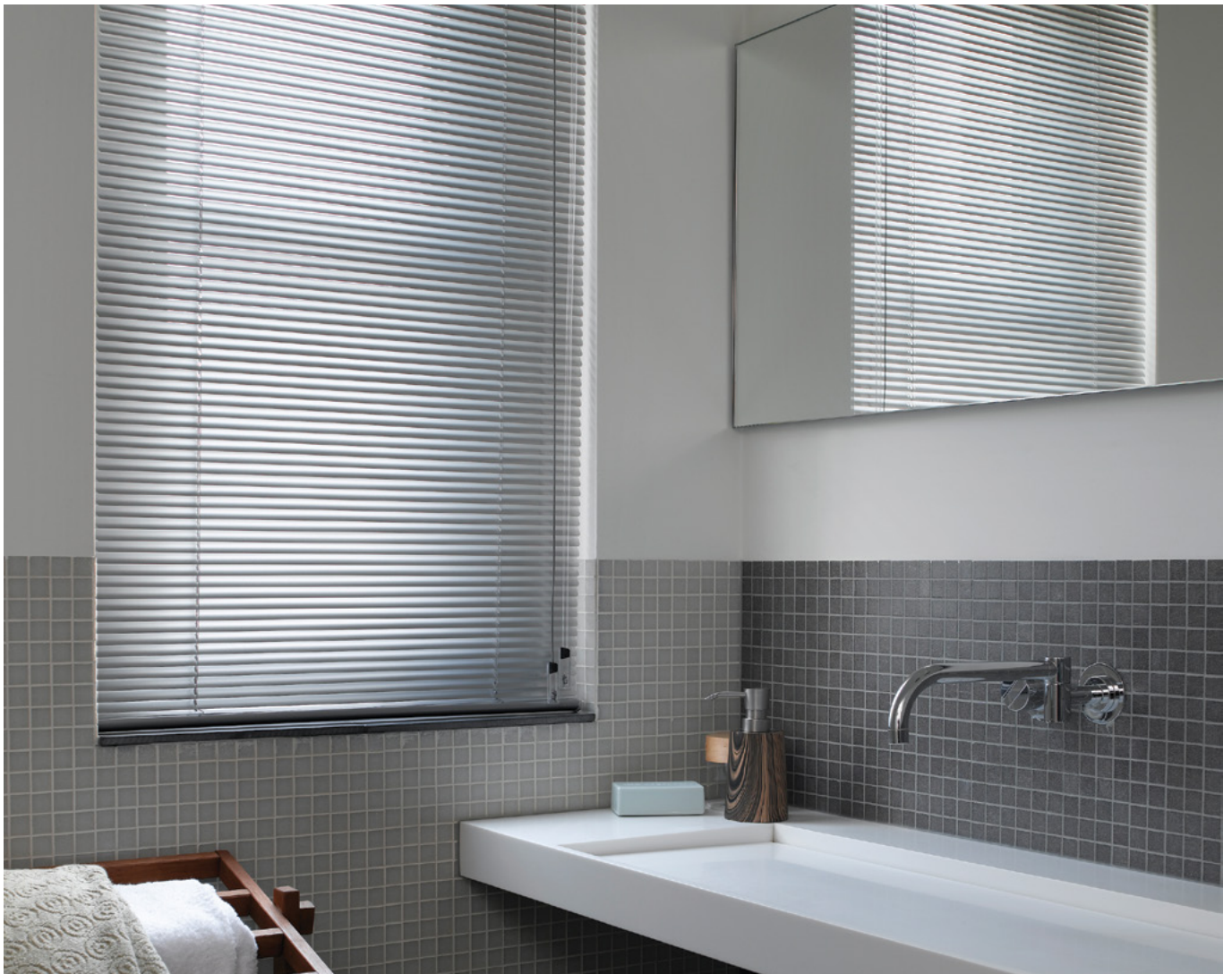
25mm Aluminium Venetians