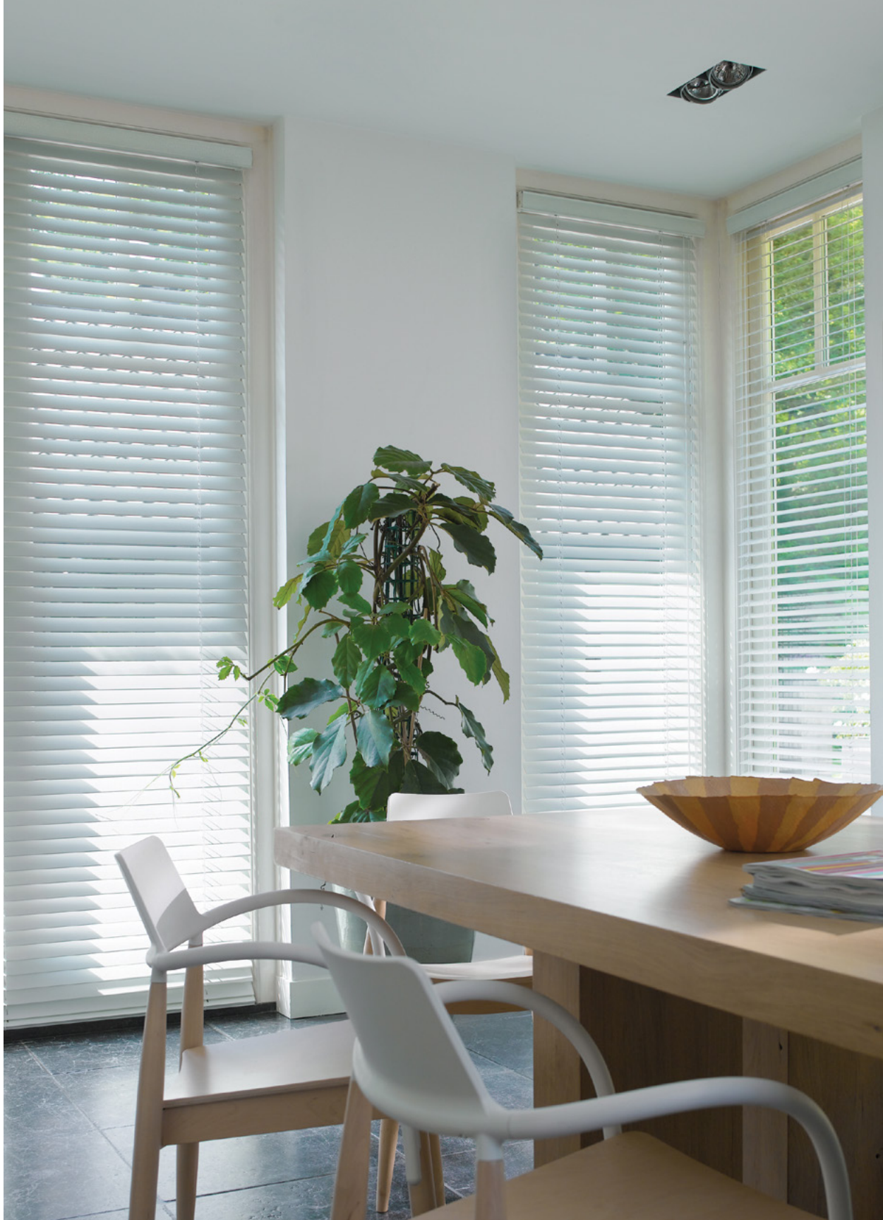
50mm Woodmates® Venetians