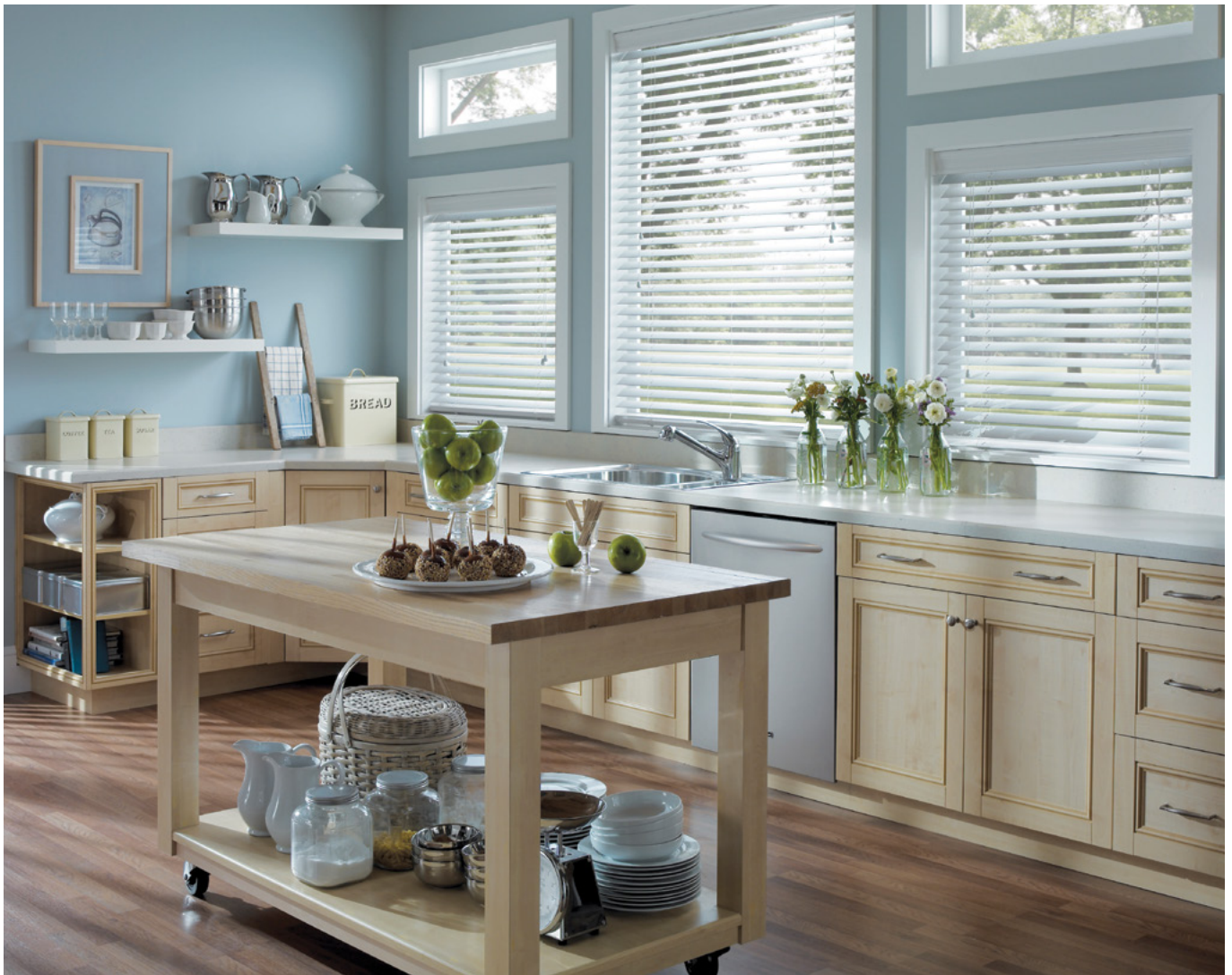
50mm Timber Venetians