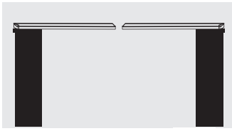
Left and right stack