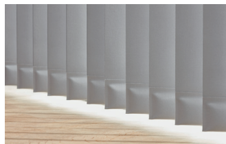
'Chainless' (Sewn) fully sewn-in weights