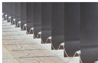
Traditional finishing with weights and chains.